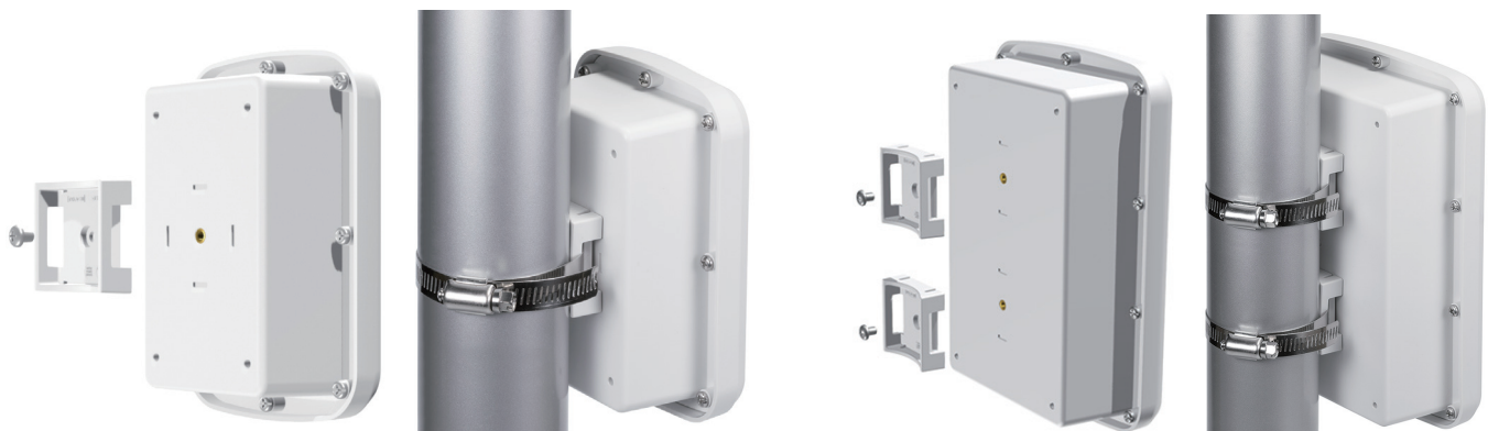
Installation (2 pcs)