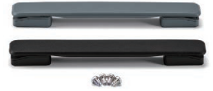
Elastomer handle FM200 series See website