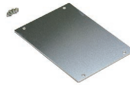
Mounting plate UCC series See website