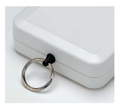
Hole milling is required for case installation.