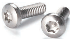
Head type (with pin)