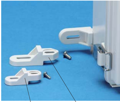
Color G Color S