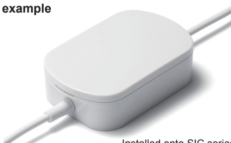
Installed onto SIC series