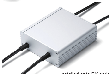
Installed onto EX series